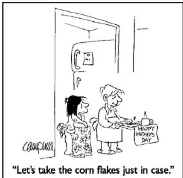
"Let's take the corn flakes just in case."

We want to give God all the praise and glory for how He met all our needs in 2021.